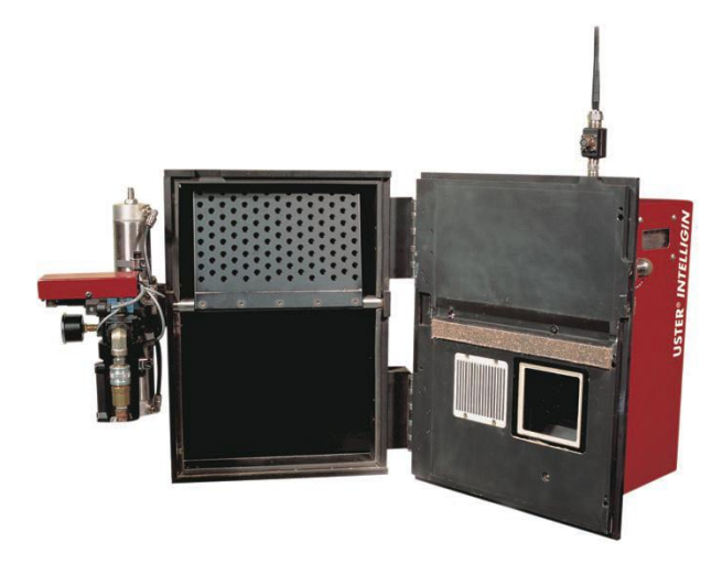
Figure 1. Uster<sup>®</sup> Intelligin<sup>™</sup>.

An example of measurement technology for on-line gin measurements of fibre properties is the Uster<sup>®</sup> Intelligin<sup>™</sup> (Abbott, 2013). The Intelligin measures the fibre's colour, trash, and moisture (Figure 1). The Schaffner IsoTester<sup>™</sup>/Gin Wizard<sup>™</sup> systems (no longer available) measures at-line (in the gin) fibre length, strength, colour, trash, moisture, neps, seed coat fragments, stickiness, and micronaire (the only gin-associated unit to monitor micronaire) (Figure 2).