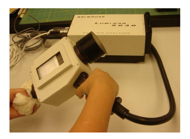
Figure 5. Brimrose Luminar<sup>™</sup> 5030 portable NIR unit.

Research is continuing on field measurements of key fibre properties, with emphasis on seed cotton micronaire. Preliminary field trials on 15 cotton varieties with a portable Brimrose Luminar<sup>™</sup> 5030 NIR unit (Figure 5) successfully demonstrated the method's ability to detect differences between "high-medium-low" micronaires (HVI<sup>™</sup> reference) for over 80% of the samples using laboratory NIR calibrations for micronaire (trend and outlier analyses; Rodgers et.al., 2010c; Figure 6). Protocols were developed for both field measurements and near field/"at-line" measurements, and all in/near field measurements were made directly on the cotton boll.