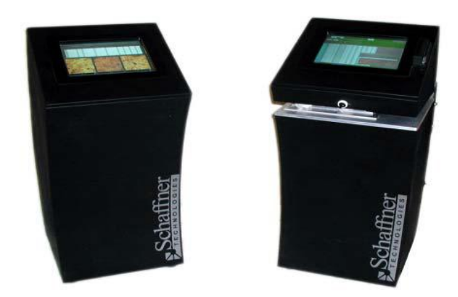
Figure 2. Schaffner Gin Wizard<sup>™</sup>/IsoTester<sup>™</sup> systems.

Recently, much research has been performed in the areas of fibre moisture and plastic contamination. In addition to fibre moisture measurements with the Intelligin (on-line) and IsoTester (at-line), "on-line" bale moisture content can be measured by the use of microwave technology. A microwave unit developed by Pelletier (2006) is continuing to be refined. Delhom and Byler (2008) measured the variations in bale moisture content with the Vomax 851-B microwave unit, and the commercial Samuel Jackson Tex-Max<sup>™</sup> microwave unit also measures bale moisture (Figure 3). A recent study by Byler (2013) compared several portable and fixed bale moisture systems, and the Tex-Max<sup>™</sup> was found to be the most accurate after a simple correction. Extensive evaluations of portable, hand-held, inexpensive moisture meters have been performed by several ARS ginning laboratories (Byler et.al., 2009; Byler, 2013). Though fast, the portable meters exhibited a 95% confidence interval for bale moisture measurements of ±0.9-1.8% moisture.