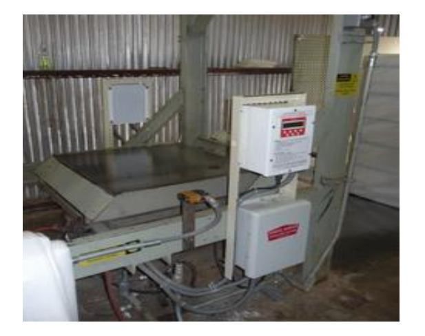
Figure 3. Samuel Jackson Tex-Max<sup>™</sup> microwave instrument.

Recently, much research has been performed in the areas of fibre moisture and plastic contamination. In addition to fibre moisture measurements with the Intelligin (on-line) and IsoTester (at-line), "on-line" bale moisture content can be measured by the use of microwave technology. A microwave unit developed by Pelletier (2006) is continuing to be refined. Delhom and Byler (2008) measured the variations in bale moisture content with the Vomax 851-B microwave unit, and the commercial Samuel Jackson Tex-Max<sup>™</sup> microwave unit also measures bale moisture (Figure 3). A recent study by Byler (2013) compared several portable and fixed bale moisture systems, and the Tex-Max<sup>™</sup> was found to be the most accurate after a simple correction. Extensive evaluations of portable, hand-held, inexpensive moisture meters have been performed by several ARS ginning laboratories (Byler et.al., 2009; Byler, 2013). Though fast, the portable meters exhibited a 95% confidence interval for bale moisture measurements of ±0.9-1.8% moisture.