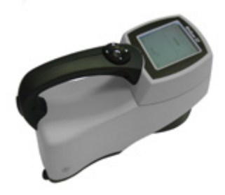
Figure 4. HunterLab MiniScan EZ<sup>™</sup> colour spectrophotometer.

Research into at-line fibre measurements in/at the warehouse is limited. The main at-line warehouse measurements are bale moisture and bale colour. Bale moisture measurements using portable moisture meters have been discussed above. Bale colour measurements have been performed at-line using portable colour spectrophotometers. in Figure (Rodgers as shown 4 et.al., 2013a). Equations/relationships for Rd and +b were developed for the HunterLab MiniScan EZ<sup>™</sup> portable colour unit, and the colour results interfaced with the MILLNet<sup>™</sup> software. Comparative evaluations on over 400 samples demonstrated very good colour agreement between the portable colour unit and HVI<sup>™</sup> colour results.