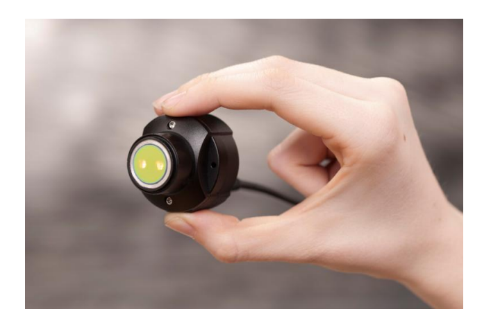
Figure 8. JDSU MicroNIR<sup>™</sup> portable NIR unit.

Table I. Portable NIR unit instrumental specifics.