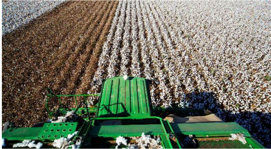
Cotton harvest

players in the global market. Furthermore, the publication includes detailed insights into the entire textile supply chain with a focus on German-speaking countries and Europe.